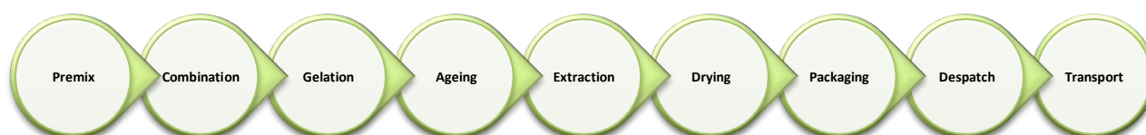
Bluedec SL- ST-A2® Production Process

The main process steps are highlighted in the flow diagram below.